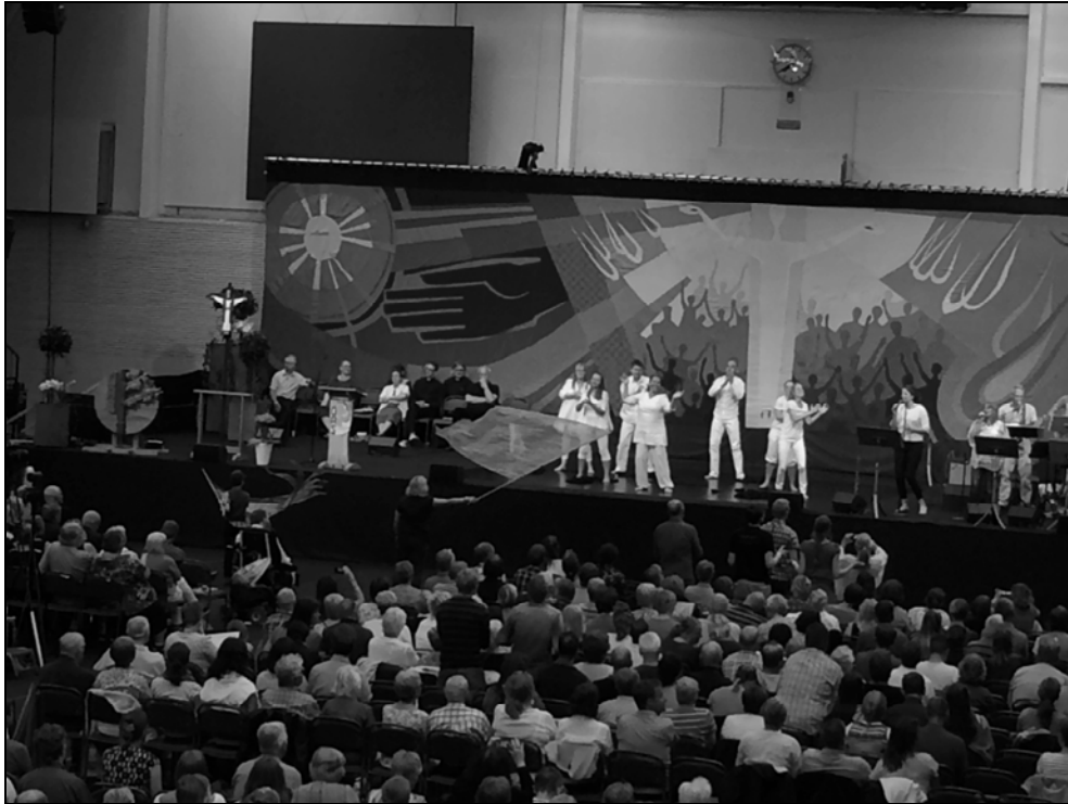
Figure no. 1 – The Oasis Leadership sitting to the left on the platform. A hymn-singing dance group performs in the centre with a vocal group to the right at the summer Oasis meeting in Jönköping, 2015.