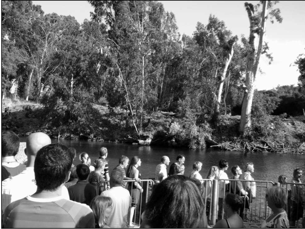
Figure no. 12 – Participants in a pilgrimage in 2008 affirming their baptism in the River Jordan in Israel.