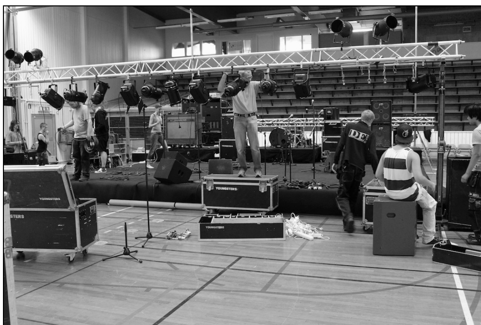
Figure no. 19 – Great emphasis is placed on using the modern musical instruments set up on the platforms of major meetings of Adult Oas, Youth Oasis and Youngsters, in 2015.

new age. There is in this way an oscillation between continuity and change. In an interview Berit Simonsson stated that since the Swedish Church has abandoned its traditional theological policy and departed from its historical basis, the Oasis Movement takes over and protects previously accepted values. In addition, the movement rediscovers older rituals now disregarded within the Swedish Church and whose roots are found in the Old and New Testaments. The independence emphasised by the Oasis Movement for its members concerning the practicing of various rituals (see above) suits contemporary individualism that resists coercion and conformity.