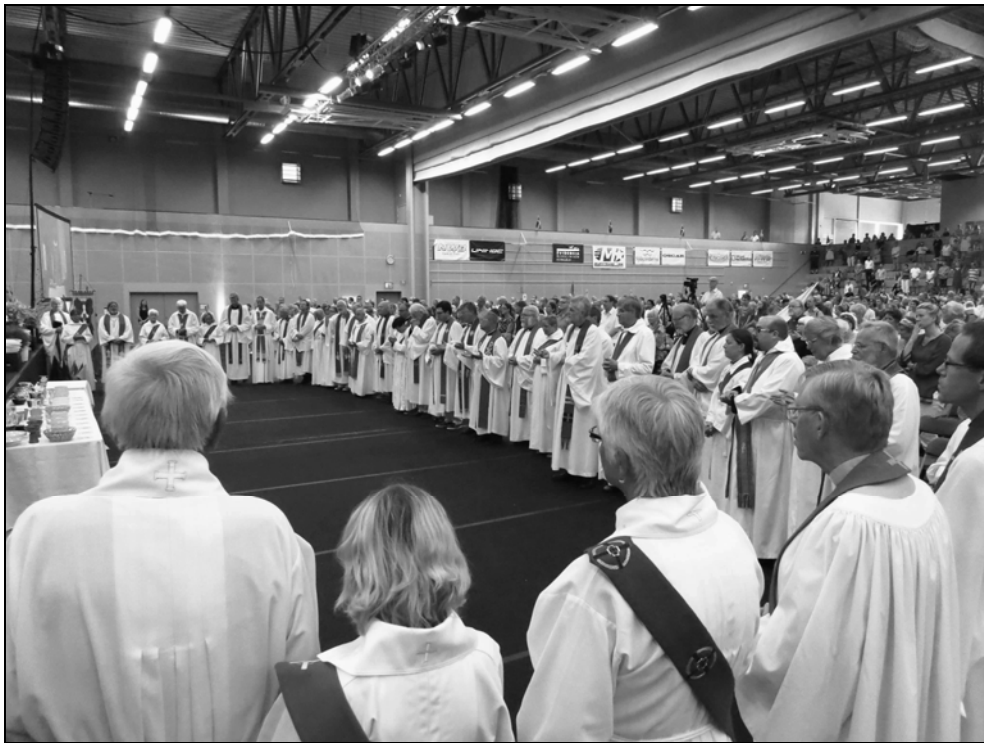
Figure no. 6 – Clergymen and deacons waiting to take communion at the Festive High Mass in Kungälv in 2014.