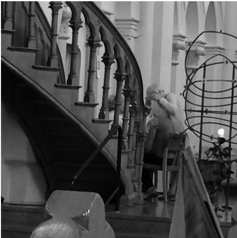
Figure no. 9 – Intercession and laying hands on the persons’ head in Sofia Church Jönköping, 2015.

long historical summary about this use in the same issue. He emphasised that oil has a deep symbolic value in the Bible, “partly for the spirit of God but also for life, health and blessing”. Jesus’ apostles anointed the sick with oil to cure them (Mark 6: 13 and James 5: 14). Luther also stressed the importance of anointment with oil and believed in its effect on health. He even worried about a lack of expectation in the result. (Oasblad, 2002/3) This historic foundation for the usage is seen as being very clearly confirmed both in the Bible and with Luther.