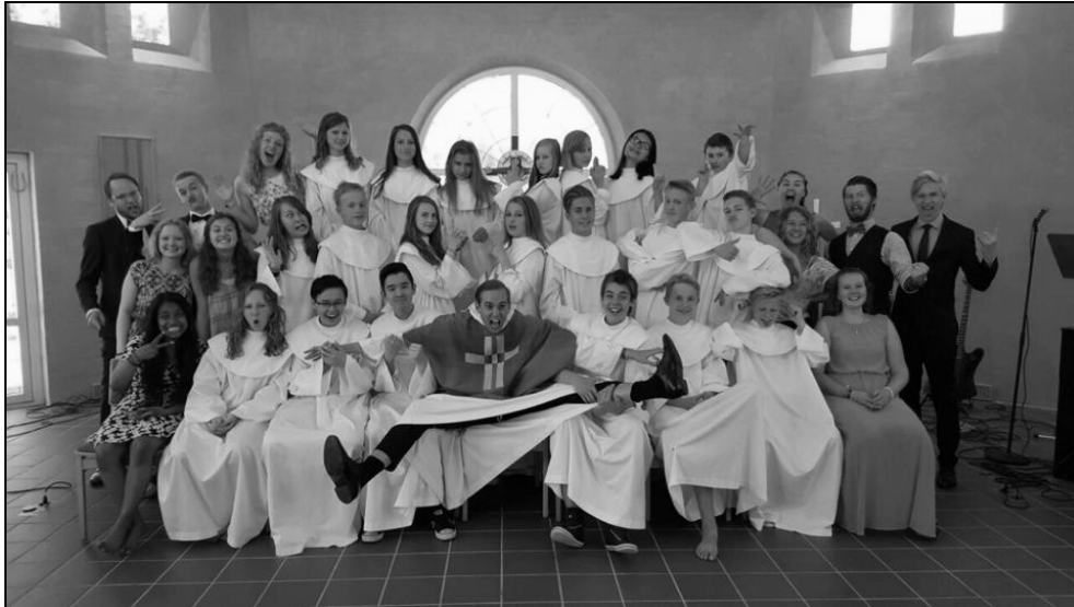
Figure no. 5 – Oas-confirmeds in 2015 at the Helsjön Folk High School. Note the happy atmosphere that is accentuated by the frolicking clergyman.