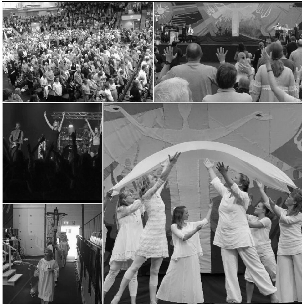
Figure no. 17 – Dancing, singing and waving hands on the platform at Jönköping, in 2015.