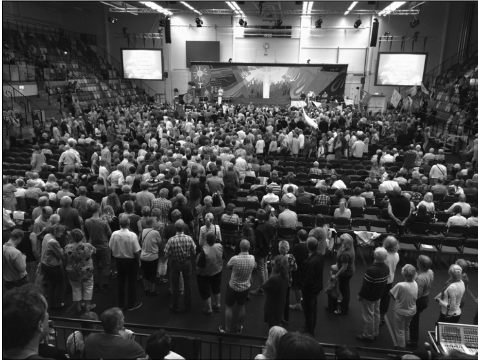
Figure no. 7 – Long queue to the communion at the summer meeting in Jönköping in 2015.