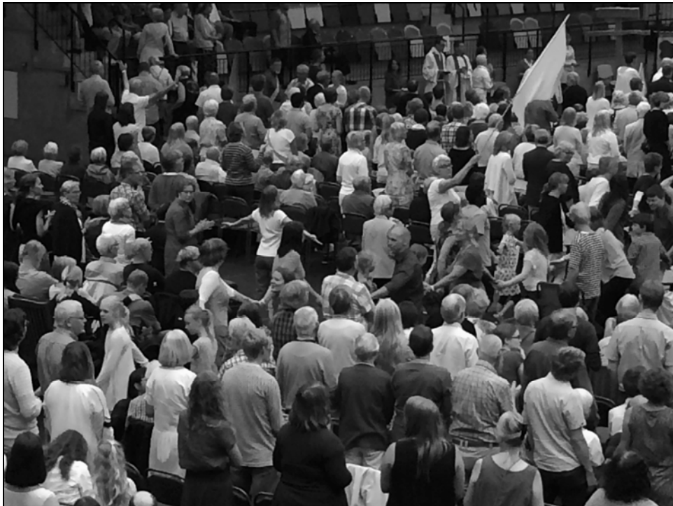
Figure no. 18 – Dancing hand-in-hand and singing in Jönköping, in 2015.

Kristina Rage wrote in 2009 and 2010 two detailed articles on the liturgical dance to the glory of God. She referred to the “dances of praise” mentioned in both the Old and the New Testaments, although most of her examples are taken from the Old Testament. “Approval of songs of praise, music and dance is found in Psalms 149 and 150”. According to Kristina Rage, all forms of dancing should be free and unregulated in order to suit different people who wish to dance. “When we dance before the Lord, we can use all the steps, hops and movements we know or can be inspired to”. (Oasblad, 2009/2, 2010/2) This follows the Oasis Movement’s often expressed ideal of freedom.