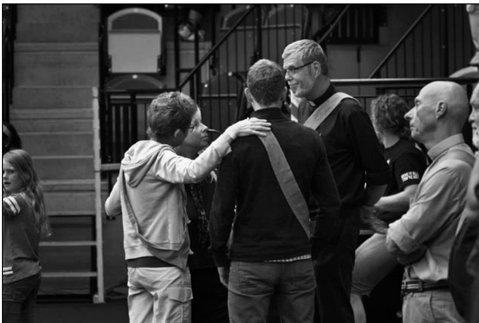
Figure no. 14 – “Prophecy verification group” with green neckbands in Jönköping, 2015.

public proclamation of the message. At the 2015 Jönköping meeting, two prophecies were presented by being read aloud by a member of the “prophecy verification group”, and not by the person who presented the message. A prophecy is considered to be a greeting from God but does not necessarily deal with the future.