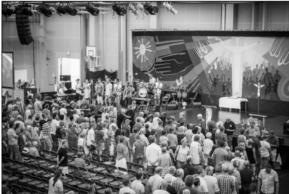
Figure no. 10 – In the first row several clergymen are anointing participants with oil in the forehead at the summer meeting in Kungälv, 2014.