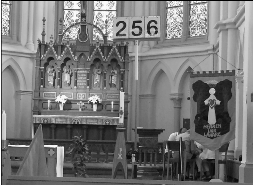
Figure no. 8 – Healing intercession to the right behind the hanging textile with the Jesus figure and the text “Lord, our Healer”. The ticket number 256 fastened on a long pole, Sofia Church, Jönköping, 2015.