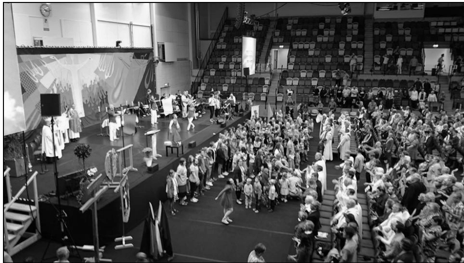
Figure no. 3 – A lot of children in front of the platform singing for the audience in the beginning of a large meeting in Jönköping 2015.