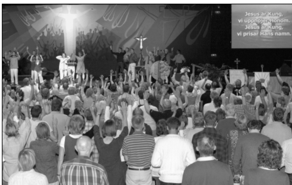
Figure no. 15 – Singing songs of praise at the 2015 summer Oasis Meeting in Jönköping. Many participants lift their hands.

Songs of Praise are led by a song group on the platform with participants at the meeting taking part, often with raised hands. Because the focus of a Song of Praise is on God and Jesus, this is not a performance by the song group but instead it is a collective manifestation. Therefore these songs and music are not applauded, as has become more usual in the Swedish Church after performances of song and music. Applause in the Oasis Movement can, however, occur after a lecture or to thank those who have arranged meetings and conferences.