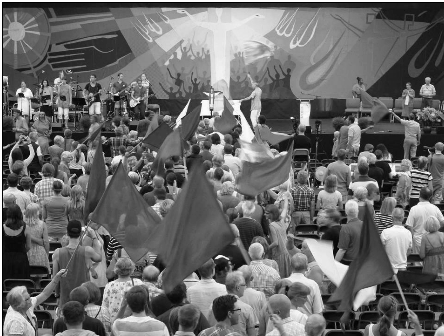
Figure no. 16 – Many, but not all participants wave large flags of different colours during singing of Songs of Praise at the Kungälv summer meeting in 2014.